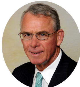
Francis Rooney US House of Representatives District 19