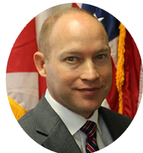
Spencer Roach Fl House of Representatives