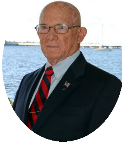
James L Dozier Major General , U. S. Army, Retired