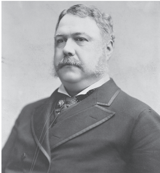
Chester Alan Arthur 5th Republican President