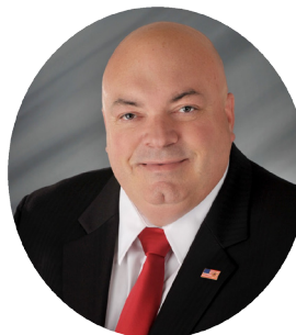
Cecil Pendergrass Lee County Commissioner