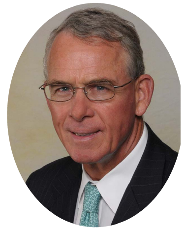
Francis Rooney US House of Representatives

America has taken the relative calm of the Western Hemisphere for granted. We have paid little attention to foreign influence from across the globe descending on the region and only now are we realizing the consequences. The growing presence of American adversaries such as Russia, China and Iran in Latin America alters the strategic landscape south of the United States and should serve as a wake-up call for United States engagement in Latin America.